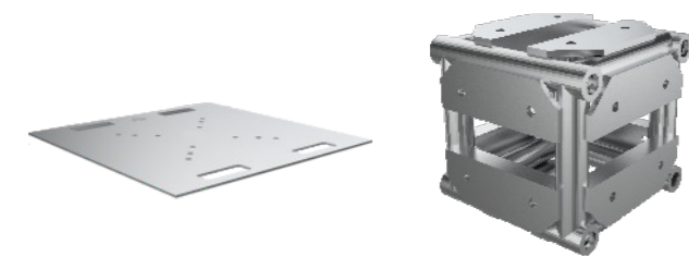
Compatible 36"x36" (914.4*914.4*15mm) Heavy Duty Base Plate for 12" & 20.5" Truss Compatible 12" 6 way Corner Block

G34 aluminum plate bolt truss is suitable for all events and performances of all sizes, providing additional rigging capacities. Its durability and strength are specifically designed for high-frequency structural applications that require higher load-bearing. The truss can be customized to meet your requirements.