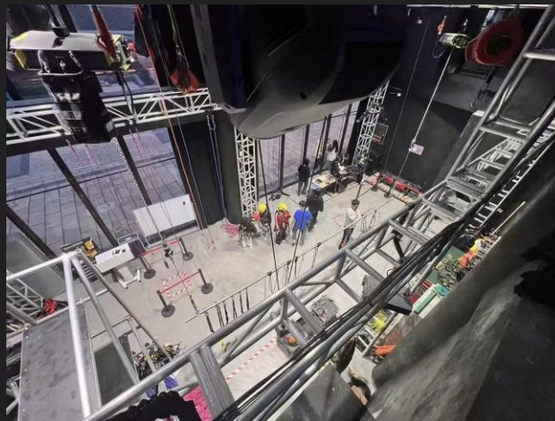
Rigging & Automation Studio, China

Location: Las Vegas – Corpus Christi – Beijing